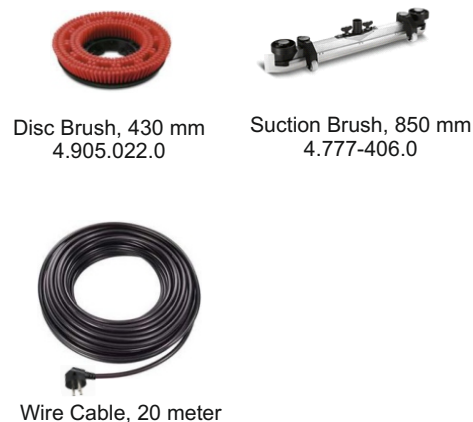
Disc Brush, 430 mm 4.905.022.0